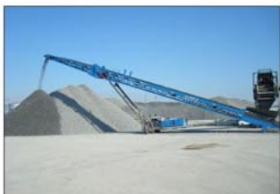
80' Radial Conveyor with a 36' stockpiling height