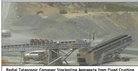
Radial Telescopic Conveyor Stockpiling Aggregate from Fixed Crushing and Screening Plant @ 1200TPH