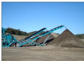
50' Radial Conveyors stockpiling sand