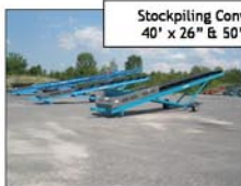
Stockpiling Conveyors: 40' x 26" & 50' x 30"