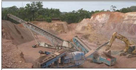
Tracked Radial Telescopic Conveyor Stockpiling Gravel / Aggregate from Primary Crusher and primary screener - 400TPH