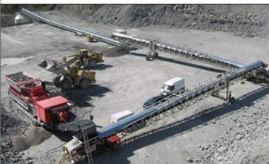
2 x Mobile Link conveyors feeding crushed limestone to land / tunnel conveyor from primary crusher.