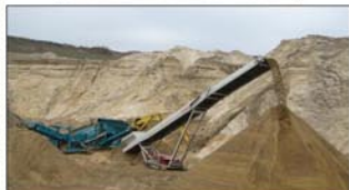
70' x 40" tracked conveyors are available for RENTALS