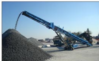
65' & 80' diesel radial stackers are available for RENTALS