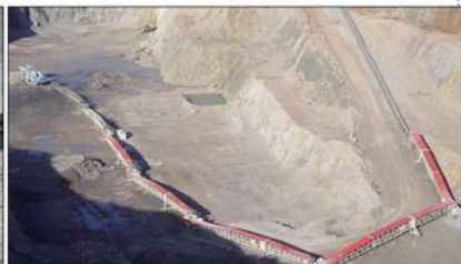
7 x Mobile Link conveyors feeding crushed aggregates to over-land conveyor from primary crusher.