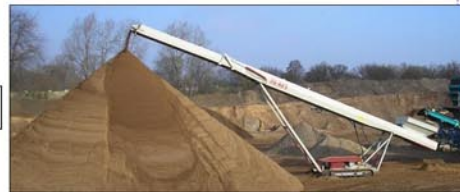
Tracked Stockpiling Conveyor Stockpiling Sand from Screener